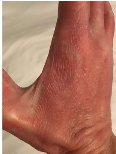
Figure 4: A bit of right hand, by thumb, other than seared.