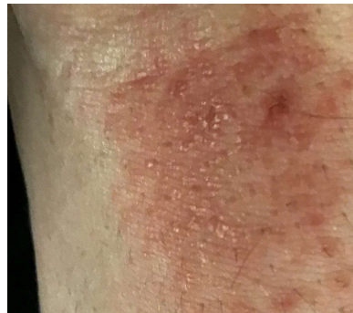
Figure 7: Inside elbow assaulted (besides DEW shots throughout arms).