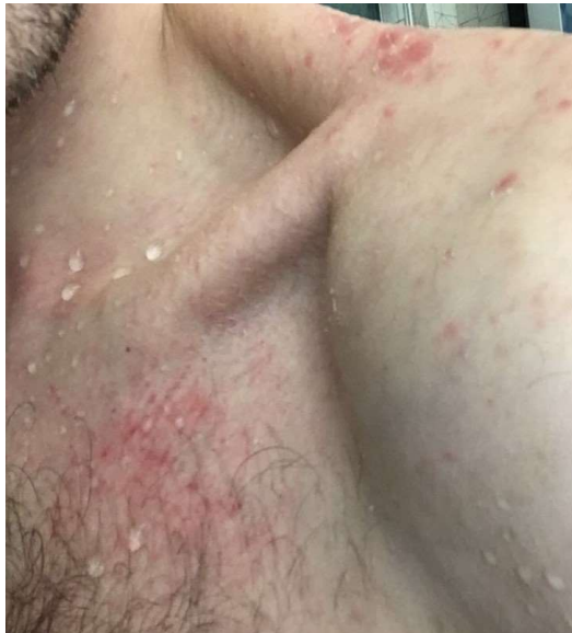
Figure 11: DEW shots into shoulder and chest, here near heart

This explains how oath-violating CIA–NSA operatives would tolerate implanting some of us in our left eyes besides our noses, ears, heads, hands, arms, shoulders, genitals etc.: they do not plan for us to thrive. (At my any early death, everyone in NSA and CIA operations, inter alia, can be legally executed under 18 USC § 241. Conspiring to violate constitutional rights: foundation of their business. The “inter alia” notably includes CIA assets in social media companies who ever censor me among others.)