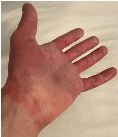
Figure 3: Left hand scorched.

In conjunction with carcinogenic chromium beyond neurotoxic barium blown into our faces, the “slow kill” aspect of directed energy weaponry (DEW) assault may be intended to incapacitate targets from countering the perpetrators while disposing of us through various DEW- and toxin-induced malignancies, covering up the covert agencies’ and contractors’ sadistic sexual assault and intellectual property theft. “Hands, fingers, knees and toes” among body parts seared on US soil: