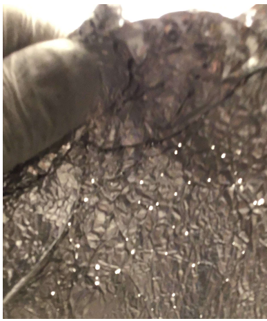
Figure 10: DEW shots penetrated foil from below (as I sat on it), similarly over chest, genitals etc.

As you might discern from Will Filer’s “NSA Mind Control and Psyops,” NSA-style operatives have fetishes with fingers and toes. (I suggested they suck their own toes in lieu of assaulting mine. That suggestion hasn’t gained traction.) Their extremity assaults can be searing; these are not from “post-hypnotic suggestions,” as demonstrated by physical harm, though a part of their operations uses the playbook Will Filer describes to a T — incessantly, in my residence, around-the-clock.