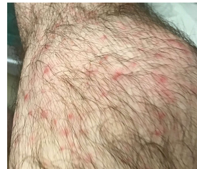
Figure 8: Right knee pummeled by DEW (directed energy weapon or weaponry) — part of a sleep-deprivation routine, foundation of NSA & CIA torture programs.