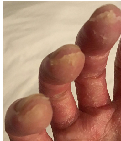
Figure 5: Fingers burned.