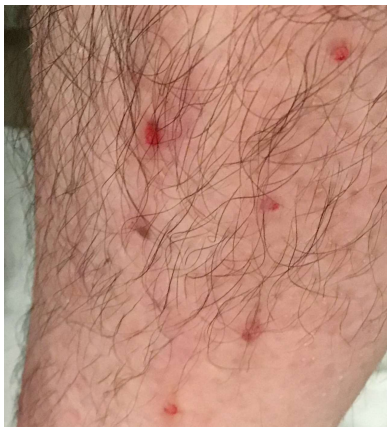
Figure 6: Shin shot by DEW, later seared as I showered, shaved and lay down.